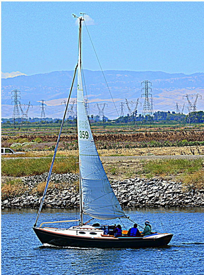
This years Adult Learn to Sail has been very successful.