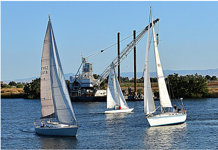
A visitor to the Wednesday night Beer Can at SSC