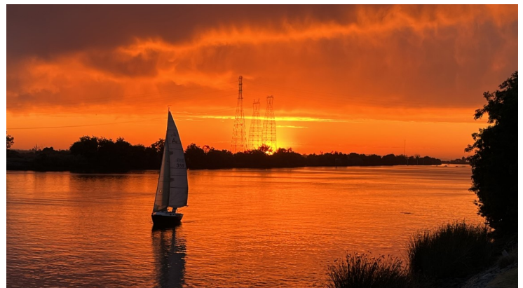
Another fabulous sunset at SSC.