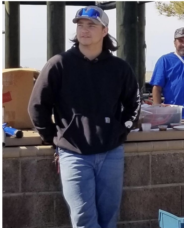
Junior member helping at Swap Meet Breakfast