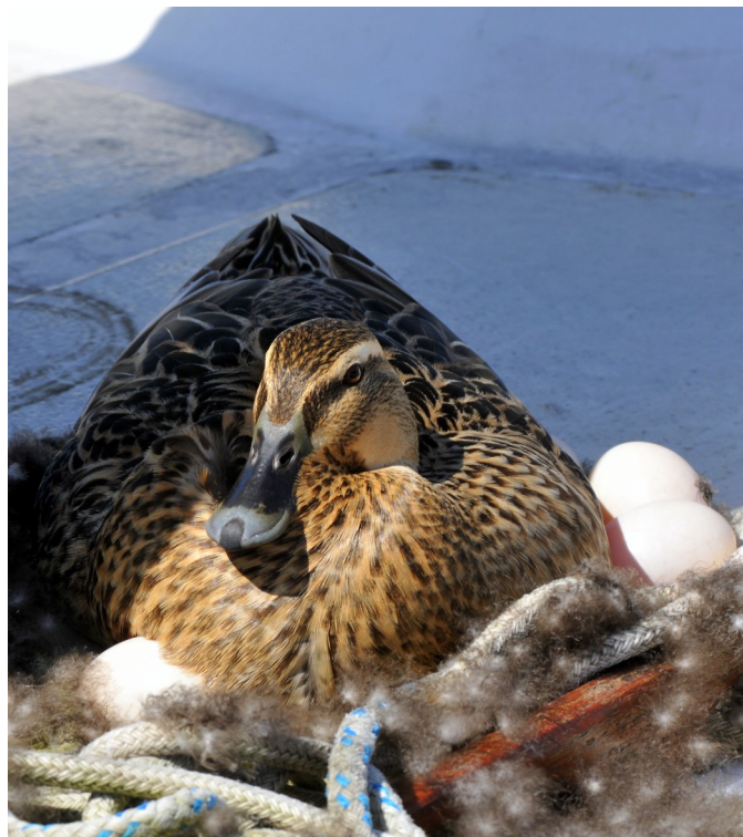
Mama Duck decided to occupy a member's boat.