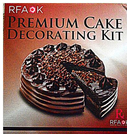
Best Looking Cake

Be sure to come out for Opening Day, April 24th. And Bakers, who have some nice prizes for the winners of the Baking Contest. All entries will be sold to the highest bidder and the pro-