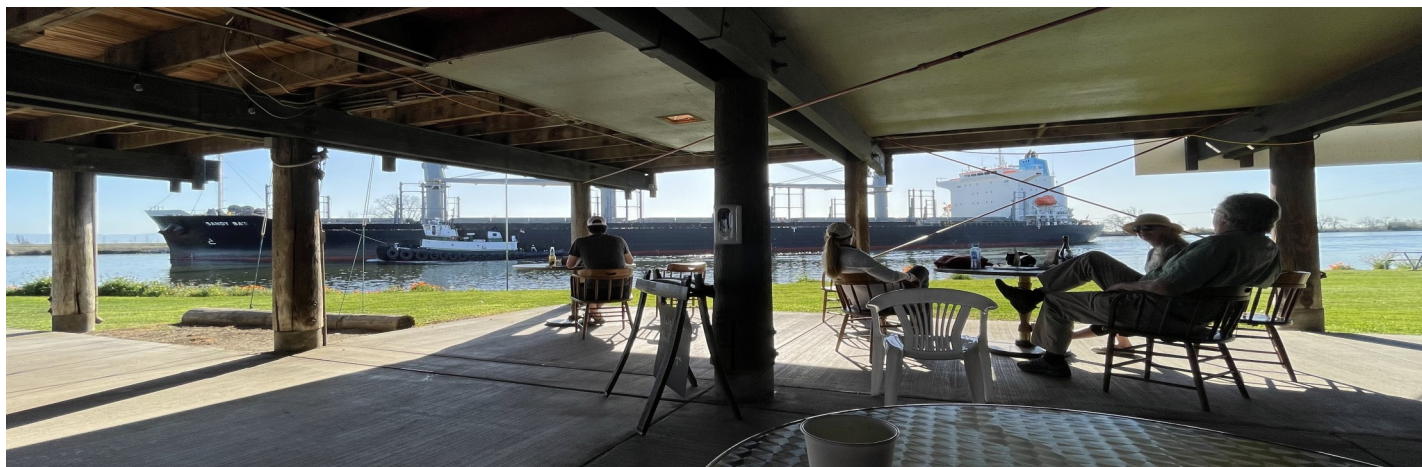
Some members signed up for fun in Small Boats.