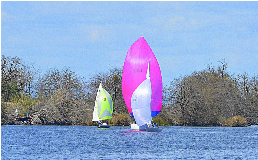
Some members went racing.