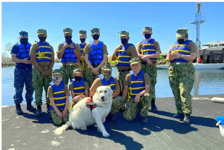
The Sea Cadets came for a visit.