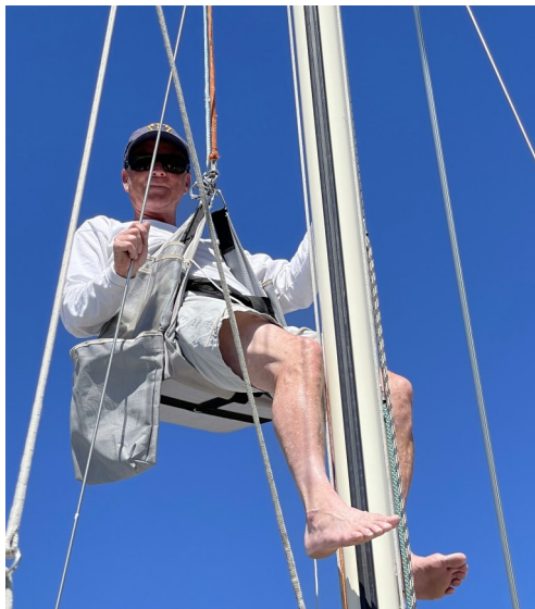
A Past Commodore did some repairs.