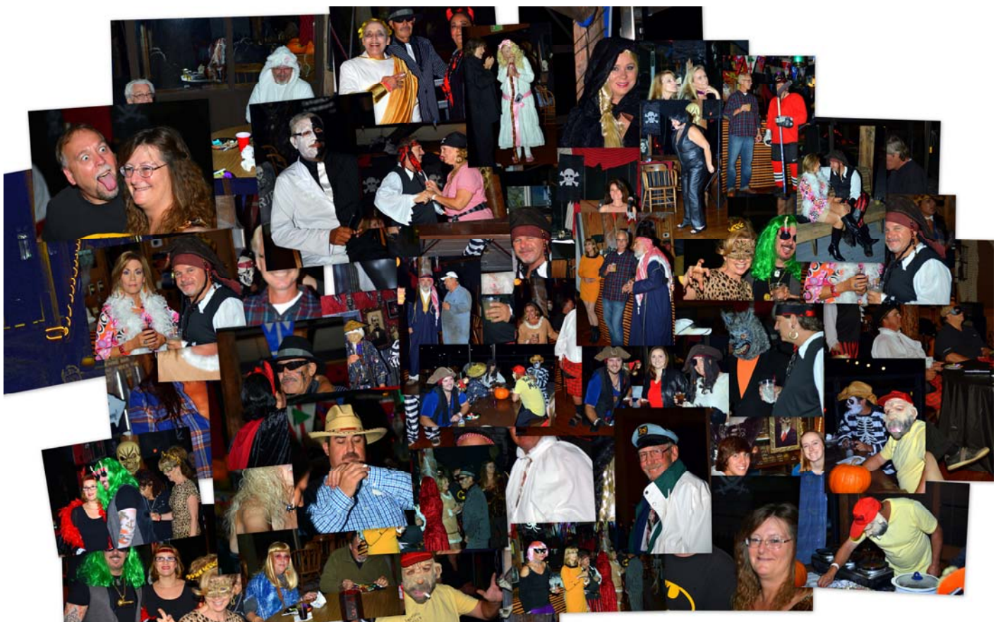
Great Halloween Party at SSC Saturday October 27, 2012

For details contact the Social and Cruise Committee