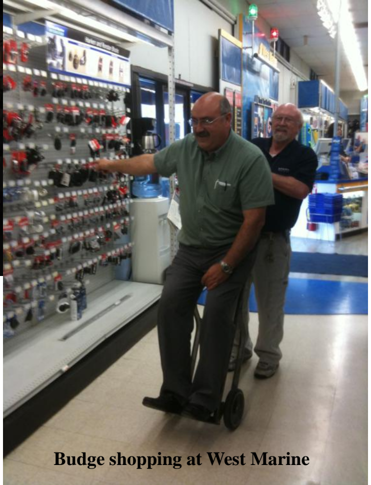
Budge shopping at West Marine

If you had sent in a picture it would be here