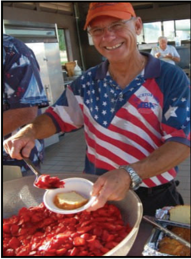
Serving up the goodies at the Doo Dah!

FIRST THURSDAY: RULES & POLICY - 5:30 PM HARBOR & FACILITIES – 7:00 PM