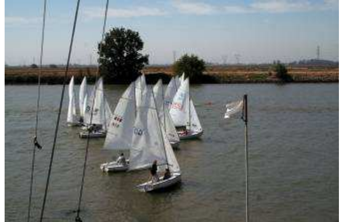
Keeping it fun – all the junior sailors who participated in the Tuleburg Regatta

Tuleburg regatta pictures courtesy of Don Doe