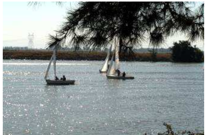
A final shot from the Tuleberg Regatta