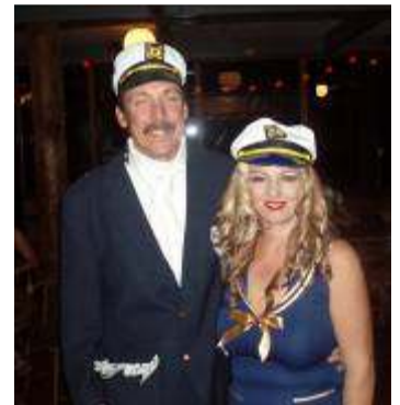
FIRST PRIZE WINNERS - WE WERE TOO FRIGHTENED TO ASK - THUG OR TUG?