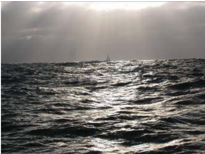
Another spectacular picture from this year's Blue Water Cruise