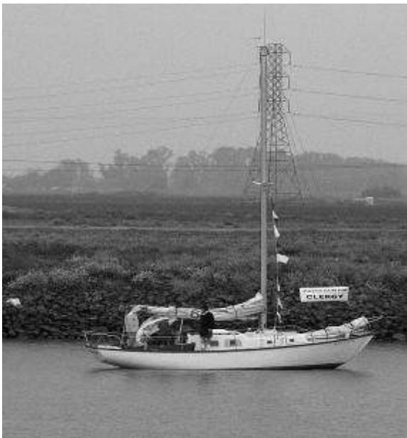
OPENING DAY - BLESSING BOAT