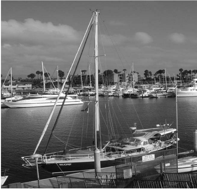
Valkyrie in Ventura (she looked so much larger at SSC)

While this story of adventure has none of the menacing seas, or other scary sailing things one might expect, it does include wind. Not all adventures in cruising take place on a boat or on the water as you will see.