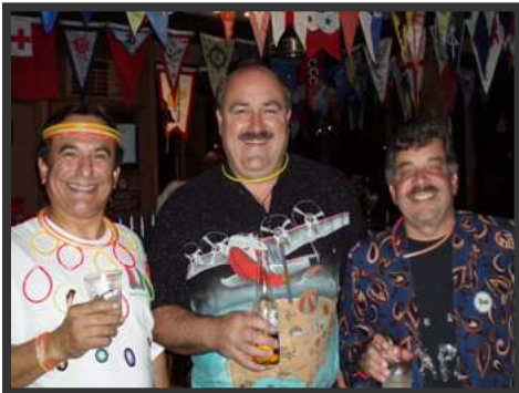
New Years Eve Party!!