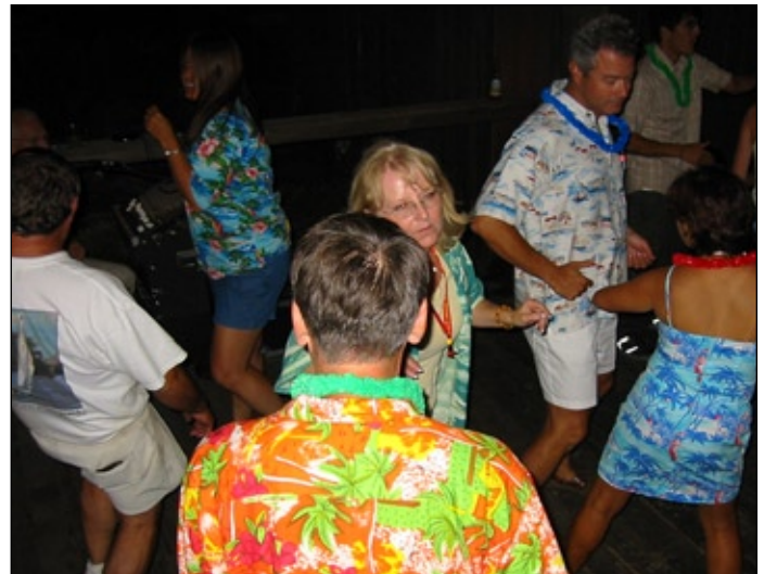
Dancing the night away, Hot August Nights Party